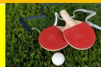
TABLE TENNIS - 9am - 12pm